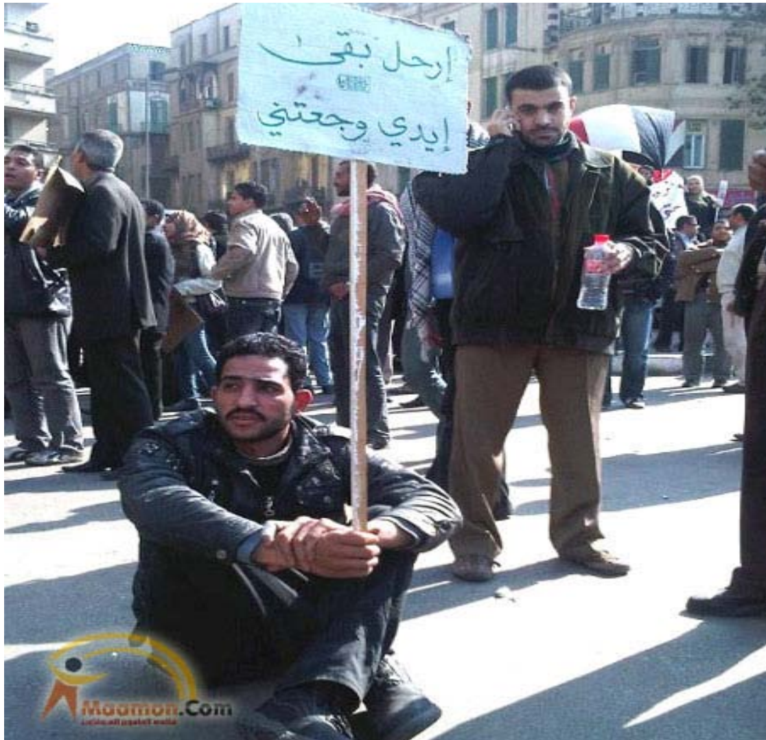
Picture 14 'irhal ba'a 'iidi waga3itni