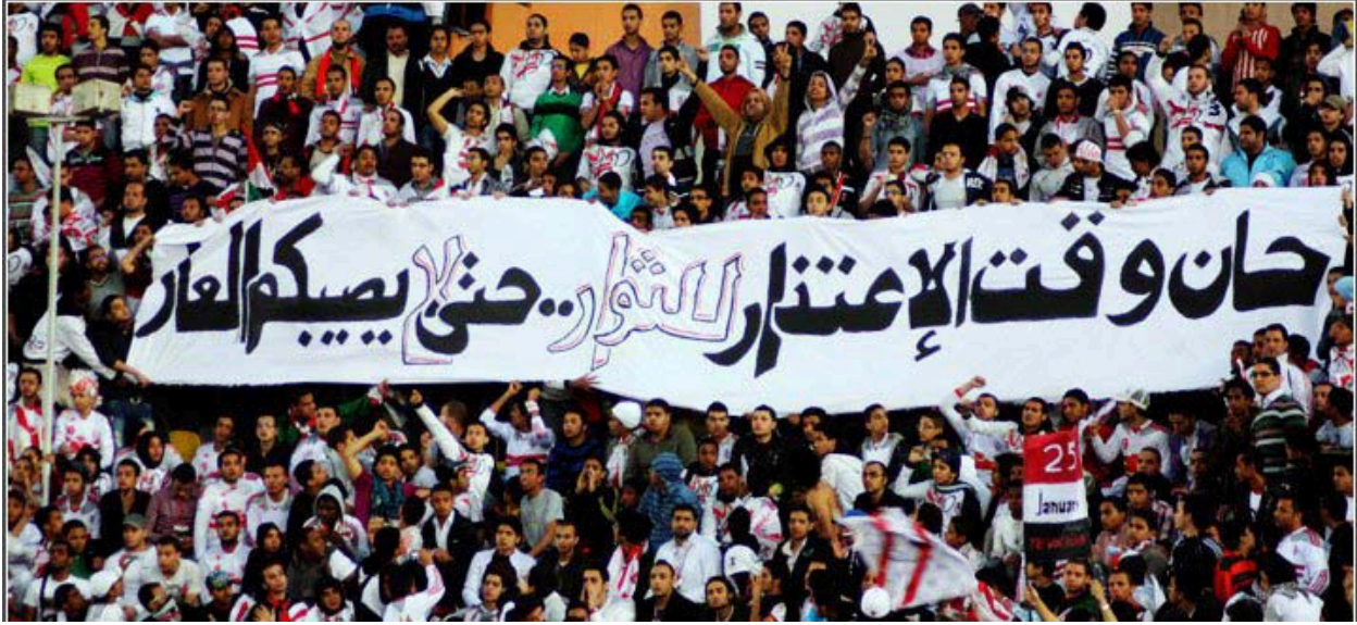
Picture 11 h aana waqta al 'i3tid h aar lilthuwwaar h atta la yu ṣ iibakumul 3aar

حان وقت الاعتذار للثوار حتى لا يصيبكم العار