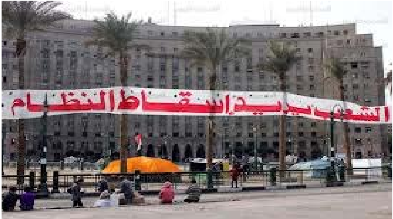
Picture 17 'assha3b yuriid 'isqaat annidh