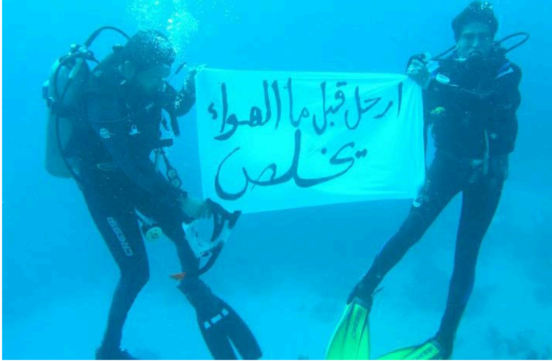
Picture 7 'irḥal 'abl-i-mal hawa yikhlās 'il' i3tidhaar liheneedi) ارحل قبل ما الهواء يخلص