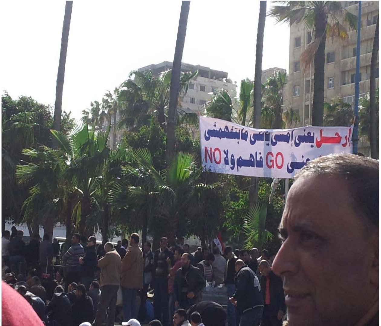
Picture 2 'irḥal ya3ni 'imshy yalli mabtifhamshi