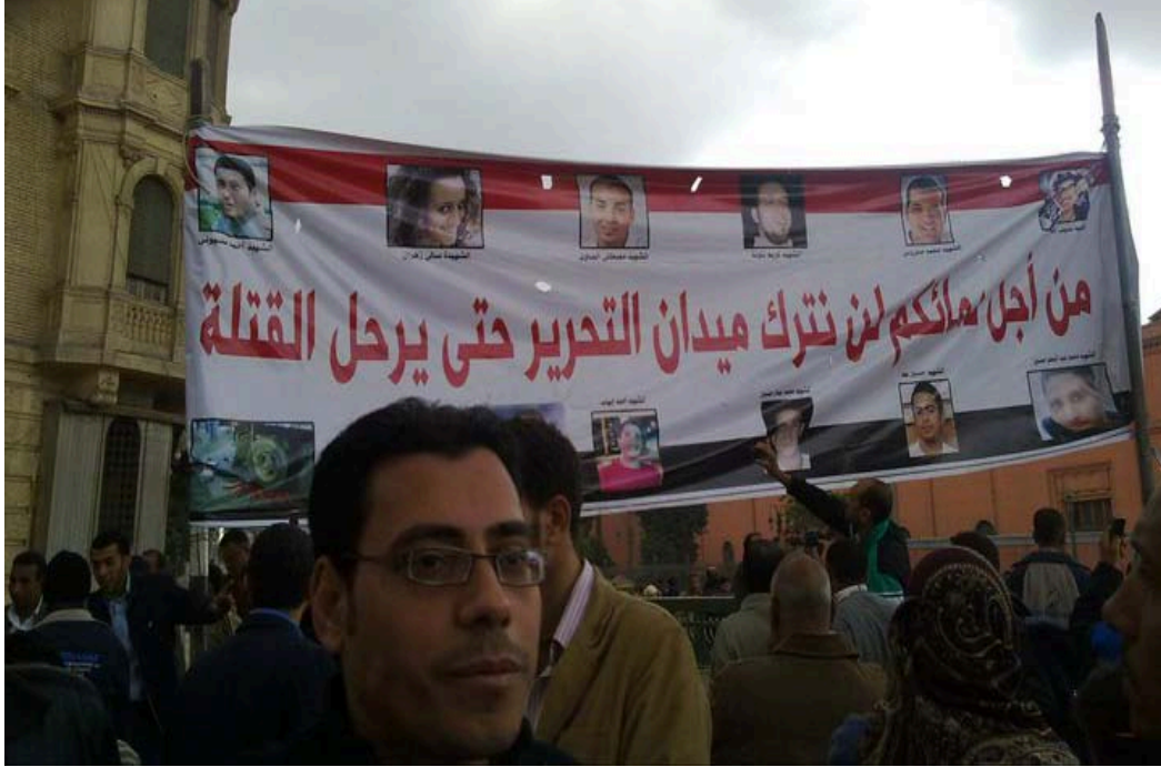
Picture 1 Min agli dimaa'ikum lan natruka maydaan 'attahriir hatta yarhal 'alqatala

من أجل دمائكم لن نترك ميدان التحرير حتى يرحل القتلة