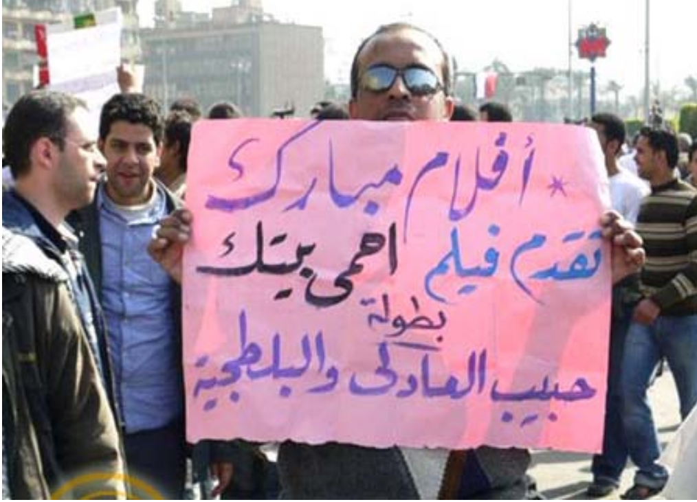
Picture 12 'aflaam Mubarak tuqaddim film 'ihmy beetak butulat habiib 'al3adly wal baltagiyya

أفلام مبارك تقدم فيلم احمى بيتك بطولة حبيب العادلى و البلطجية