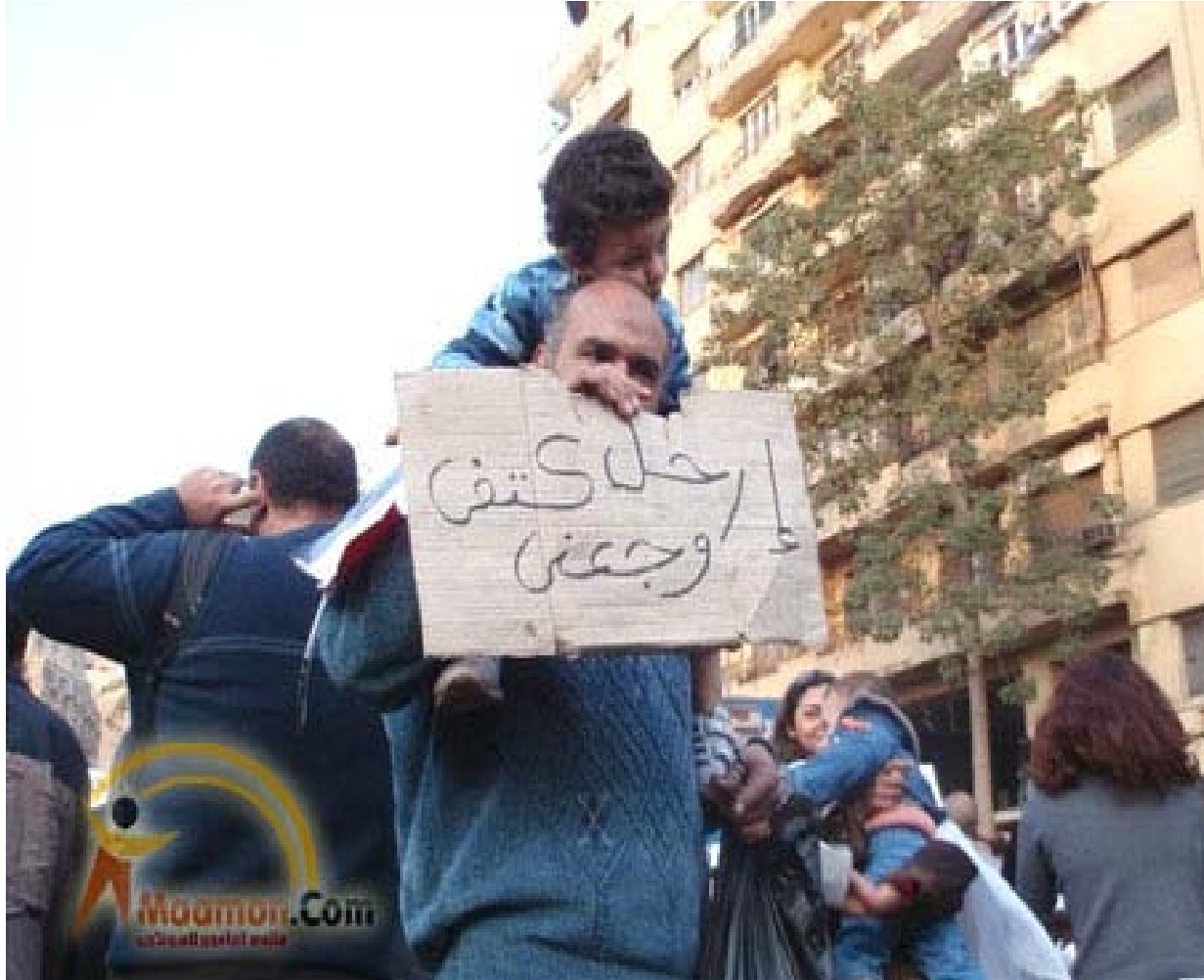
Picture 16 'irhal kitfi waga3ny