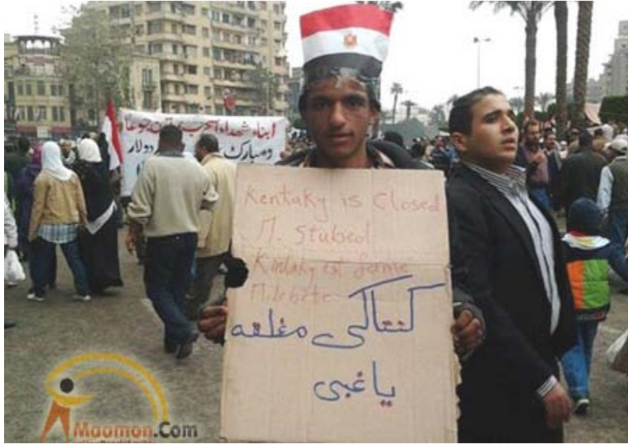
Picture 5 Kintaaky mughlaqa ya ghabi