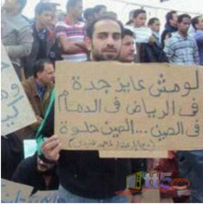
Picture 6 Law mish 3aayiz gadda fii 'irriaad fii 'iddammaam fii 'issiin ...'iss

لو مش عايز جدة في الرياض في الدمام في الصين... الصين حلوة ( مع الاعتذار لهندي)