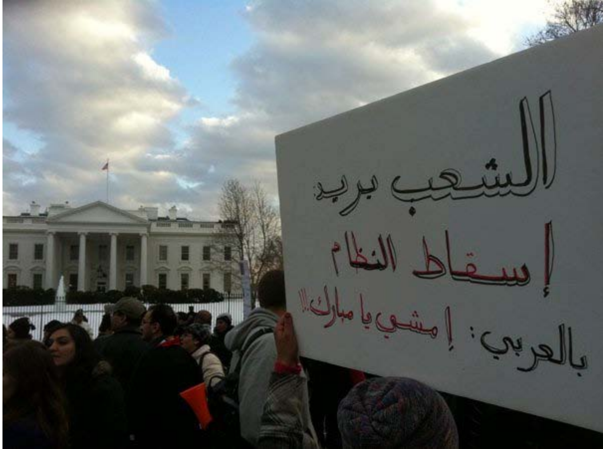
Picture 3 assha3b yuriid 'isqaat annidh

الشعب يريد إسقاط النظام بالعربي : امشى يا مبارك People want to overthrow the president in slang: leave Mubarak